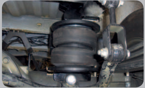
Basic system 1550221100